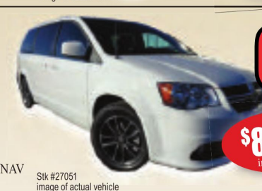
Stk #27051 image of actual vehicle