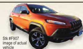
Stk #F907 image of actual vehicle