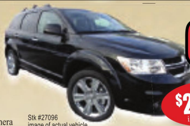
Stk #27096 image of actual vehicle