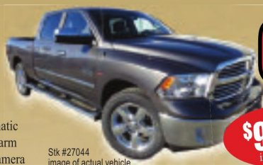
Stk #27044 image of actual vehicle