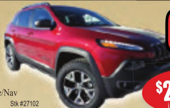
Stk #27102 image of actual vehicle