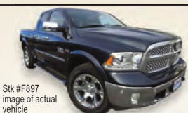
Stk #F987 image of actual vehicle