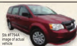
Stk #F794A image of actual vehicle